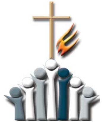
The logo of The Free Methodist Church in Canada